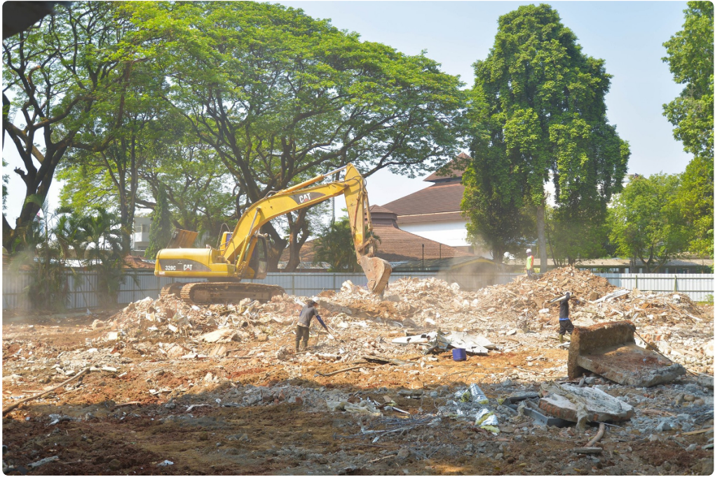
Architect's Rendering of the New High School Library